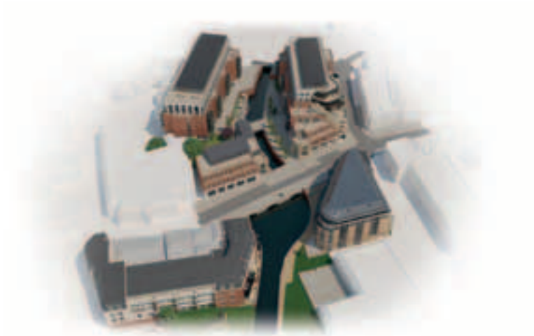
3D image to show The Picturehouse in relation to the rest of the Chapel Arches redevelopment