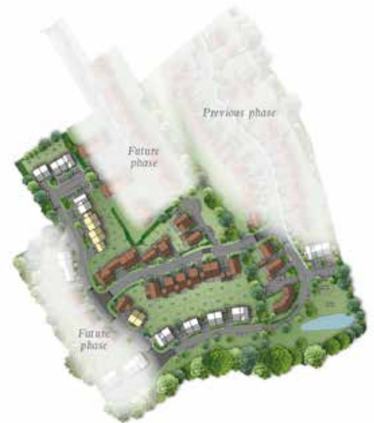
This site plan is a guide for illustrative purposes only. Landscaping shown is indicative only.