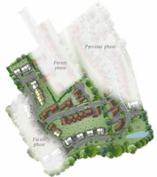
This site plan is a guide for illustrative purposes only. Landscaping shown is indicative only.