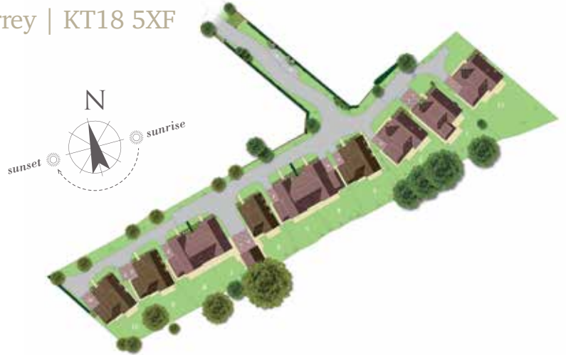
This site plan is a guide for illustrative purposes only. Landscaping shown is indicative only.