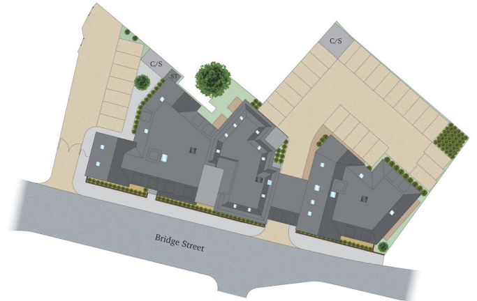
This site plan is a guide for illustrative purposes only. Landscaping shown is indicative only.