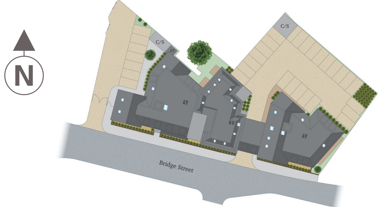
This site plan is a guide for illustrative purposes only. Landscaping shown is indicative only.