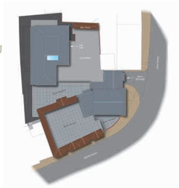
This site plan is a guide for illustrative purposes only. Landscaping shown is indicative only.