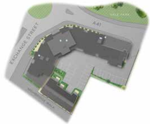
This site plan is a guide for illustrative purposes only. Landscaping shown is indicative only.