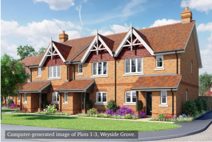
Computer-generated image of Plots 1-3, Weyside Grove.