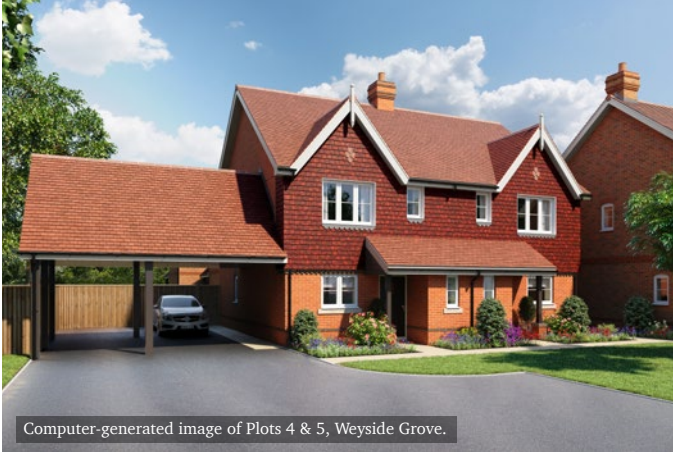
Computer-generated image of Plots 4 & 5, Weyside Grove.