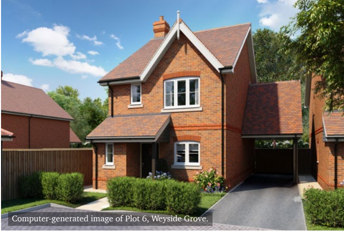
Computer-generated image of Plot 6, Weyside Grove.