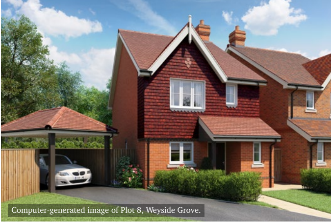
Computer-generated image of Plot 8, Weyside Grove.