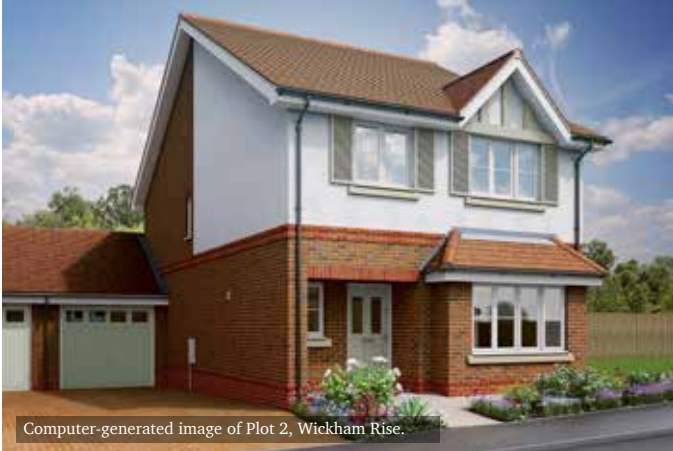
Computer-generated image of Plot 2, Wickham Rise.