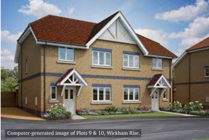
Computer-generated image of Plots 9 & 10, Wickham Rise.