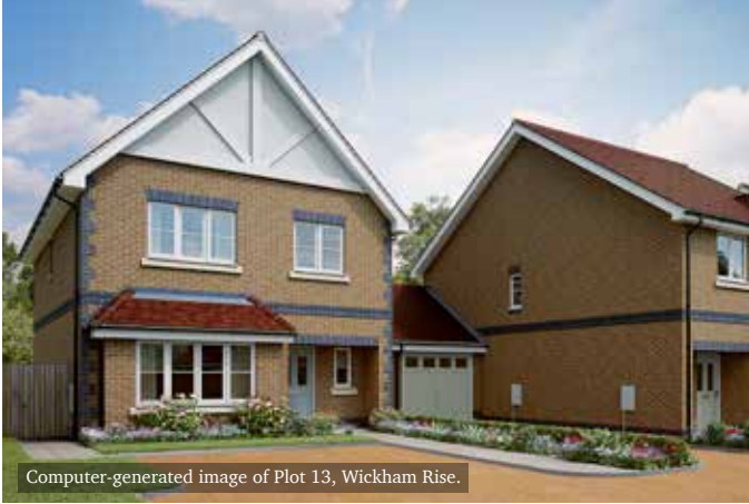
Computer-generated image of Plot 13, Wickham Rise.