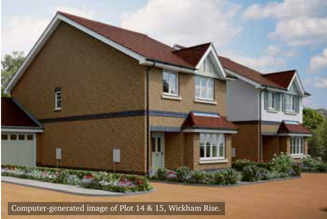
Computer-generated image of Plot 14 & 15, Wickham Rise.