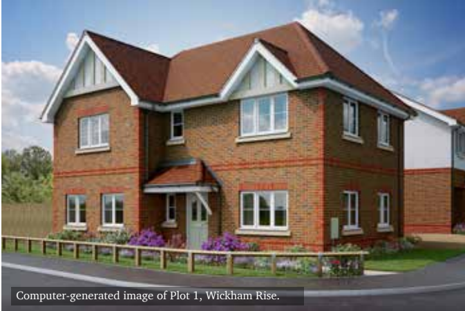
Computer-generated image of Plot 1, Wickham Rise.