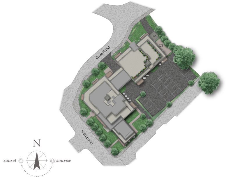
This site plan is a guide for illustrative purposes only. Landscaping shown is indicative only.