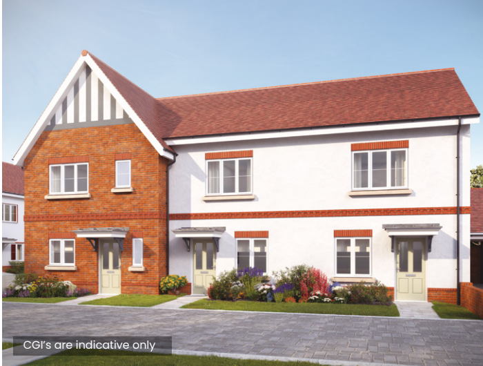
CGI's are indicative only

Little Green, Aylesbury Road, Aston Clinton, Buckinghamshire, HP22 5AQ