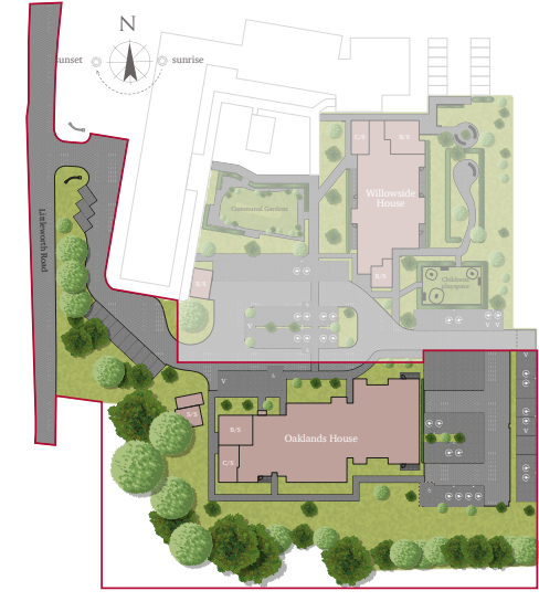
This site plan is a guide for illustrative purposes only. Landscaping shown is indicative only.