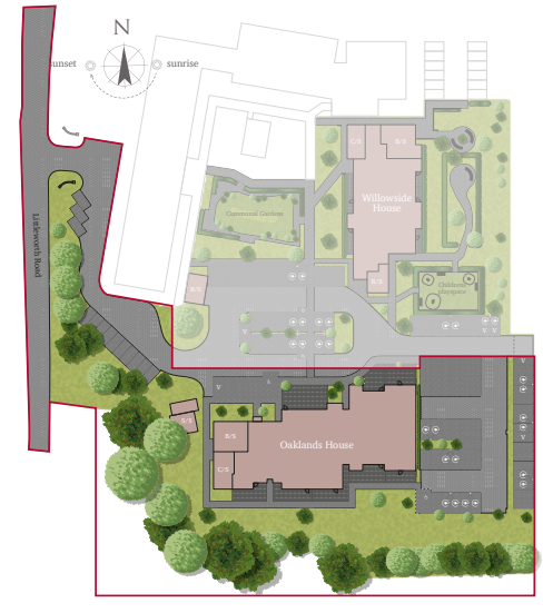
This site plan is a guide for illustrative purposes only. Landscaping shown is indicative only.