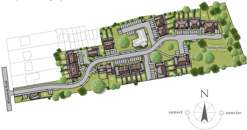
This site plan is a guide for illustrative purposes only. Landscaping shown is indicative only.