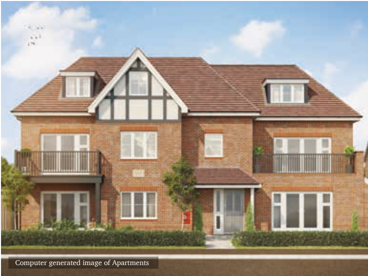
Computer generated image of Apartments

LANGLEY ROAD | STAINES-UPON-THAMES | SURREY | TW18 2EH