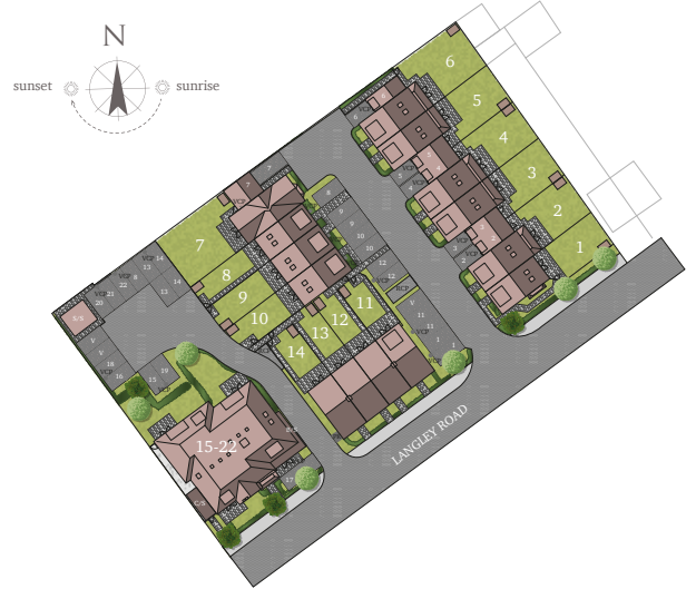
This site plan is a guide for illustrative purposes only. Landscaping shown is indicative only.