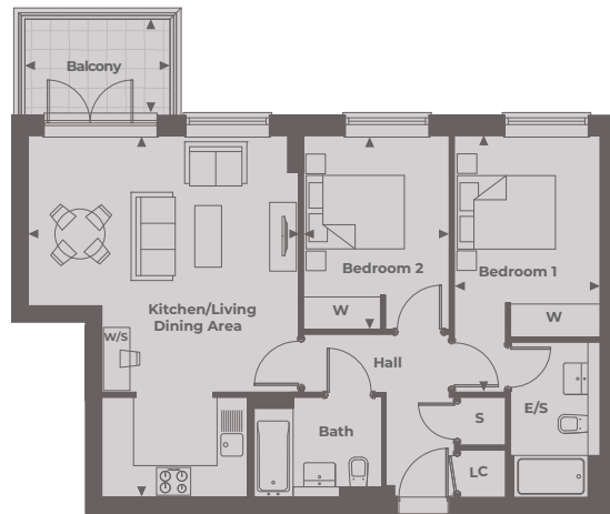
Tre Archi Apartments

Total Internal Area 69.84 sq. mts. 752 sq. ft.