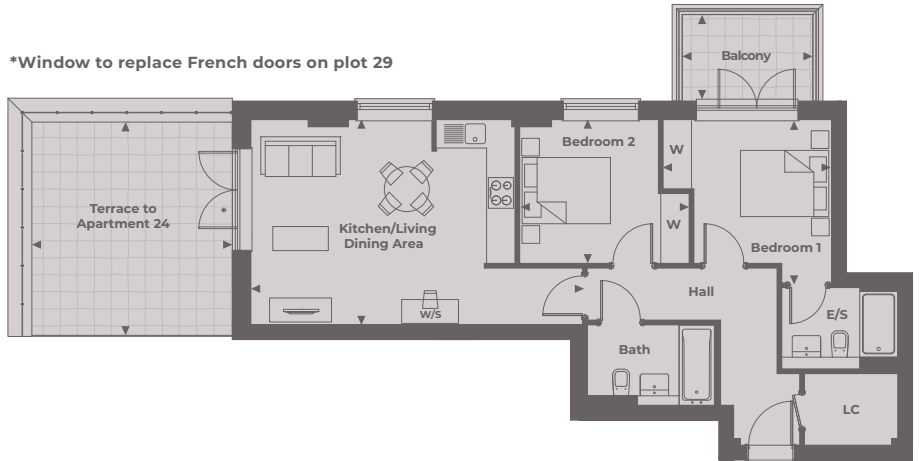
Tre Archi Apartments

Total Internal Area 68.39 sq. mts. 736 sq. ft.