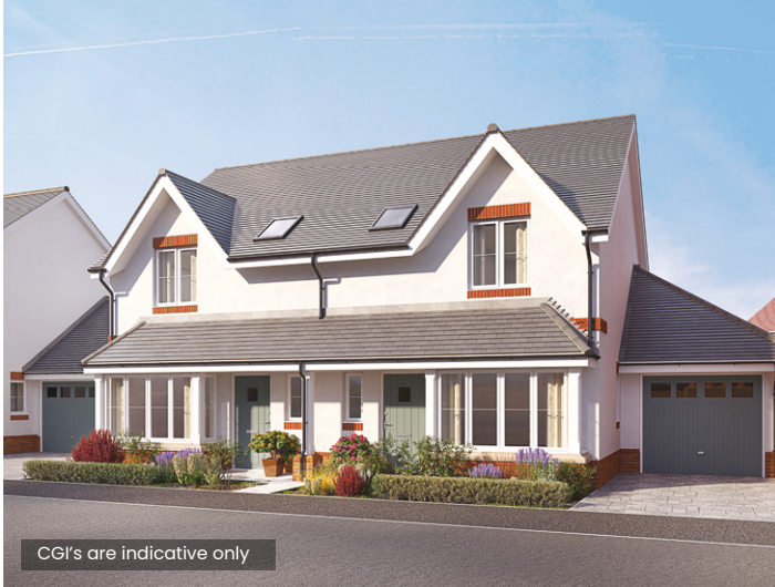
CGI's are indicative only

Little Green, Aylesbury Road, Aston Clinton, Buckinghamshire, HP22 5AQ