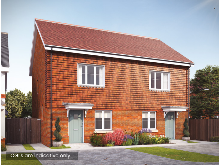
CGI's are indicative only

Little Green, Aylesbury Road, Aston Clinton, Buckinghamshire, HP22 5AQ