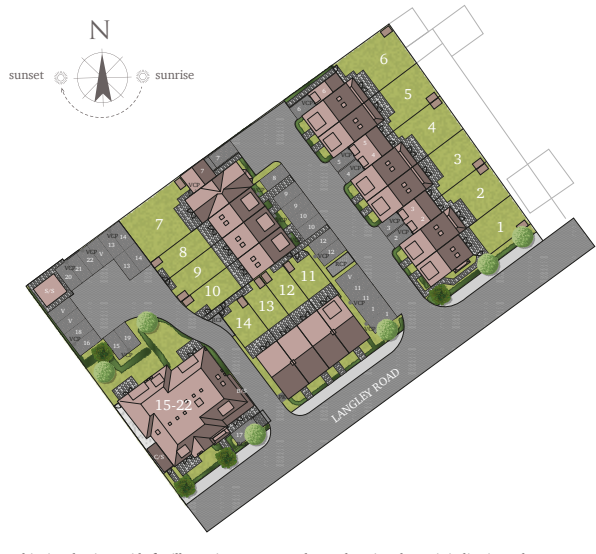
This site plan is a guide for illustrative purposes only. Landscaping shown is indicative only.